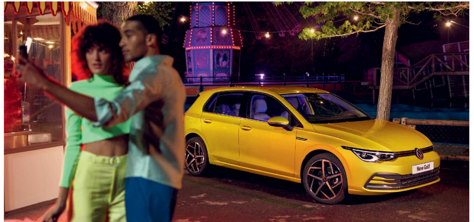
Model shown is new Golf Style with optional 18" 'Dallas' alloy wheels and 'IQ. Light' LED matrix headlights.

The maximum claim limit is based on your vehicle purchase price and is shown in your schedule .