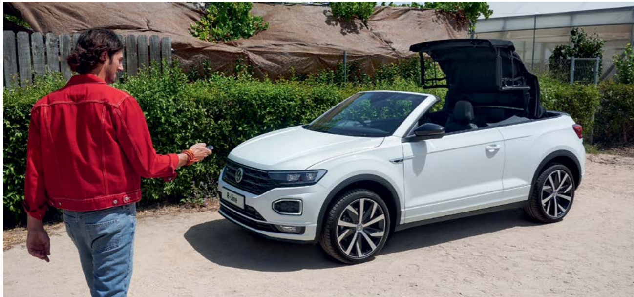
Model shown is T-Roc Cabriolet R-Line with optional 19" 'San Marino' alloy wheels and non-metallic paint.

For further information, you can visit The Motor Ombudsman website at www.TheMotorOmbudsman.org or call their Information Line on 0345 241 3008.