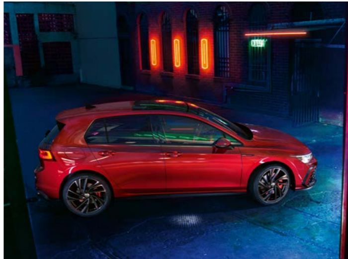
Model shown is new Golf GTI with optional 19" 'Adelaide' Black diamond-turned alloy wheels. 'Vienna' leather upholstery, panoramic sunroof and metallic paint.

The total amount you have agreed to pay us for this insurance policy. If you have not paid your premium , we will not provide cover from the date the premium was due. If the monthly payment option has been chosen and any instalment is not paid, your policy will end 30 days after the date the missed instalment was due.