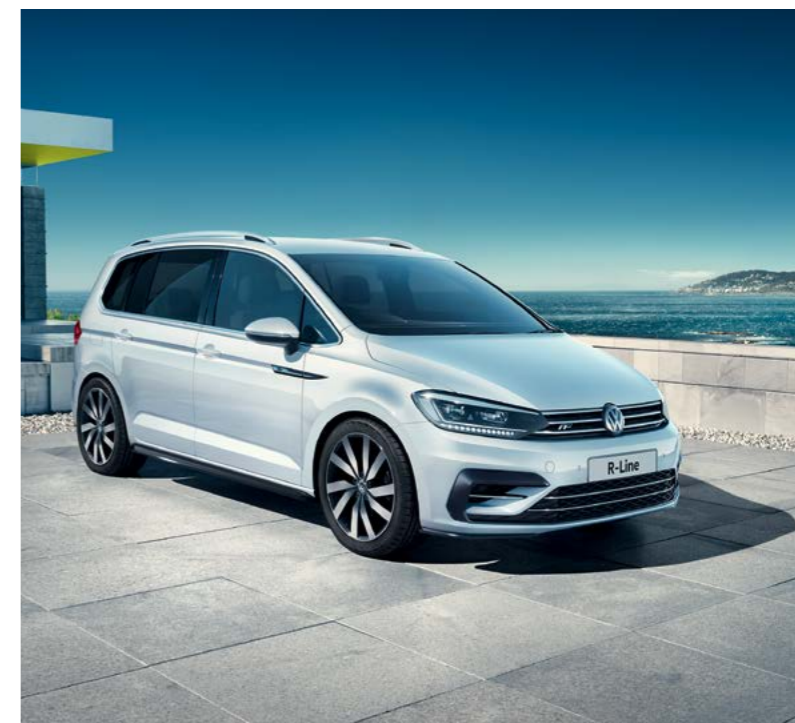
Model shown is Touran R-Line with optional LED premium headlights.