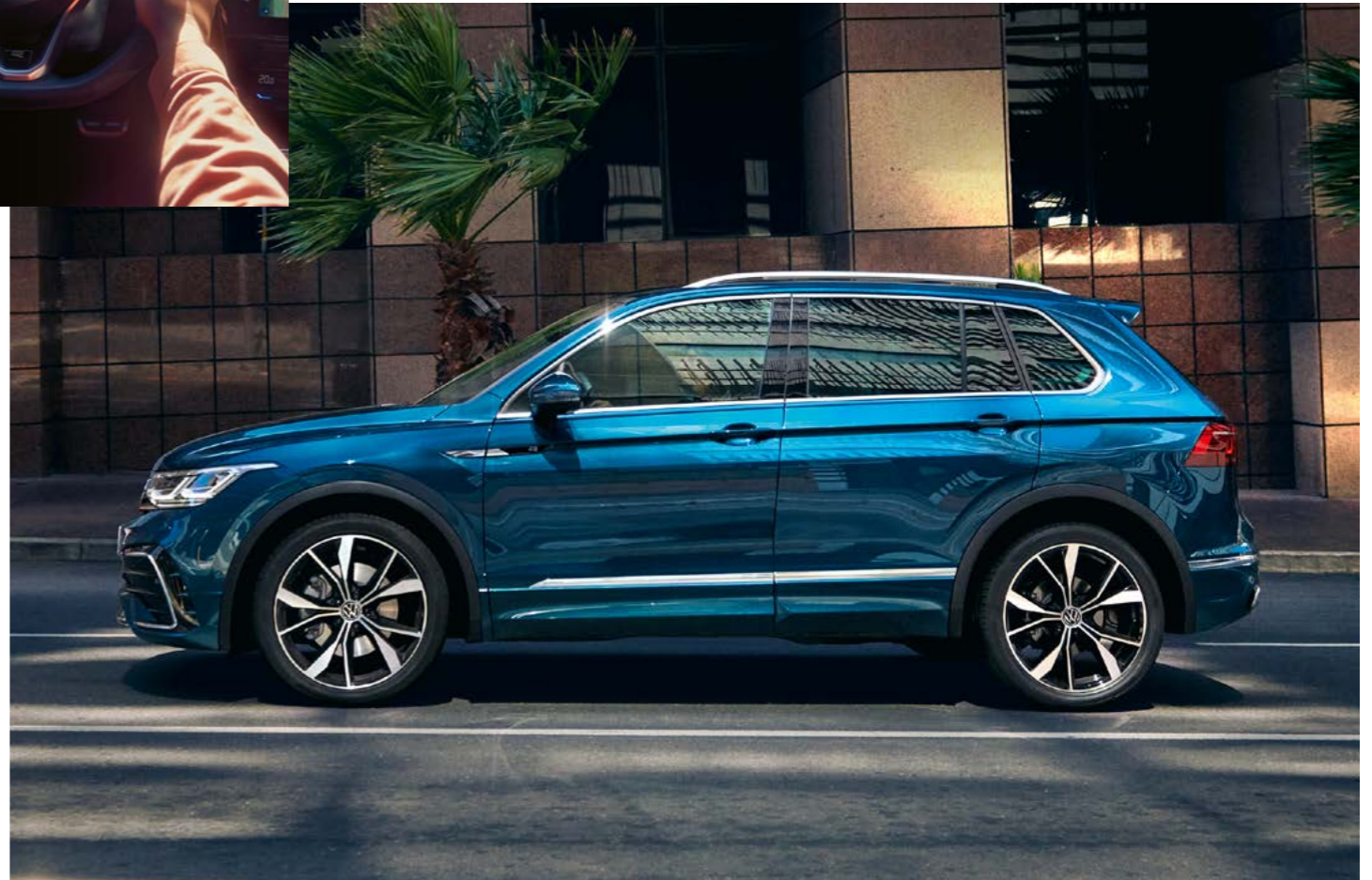
Front cover model shown is new Arteon Shooting Brake R-Line with optional 20" 'Nashville' alloy wheels, Dynamic Chassis Control (DCC), 'IQ. Light' LED headlights, Park Assist and metallic paint. Model shown on this page is new Tiguan R-Line with optional 'IQ. Light' LED headlights and metallic paint.