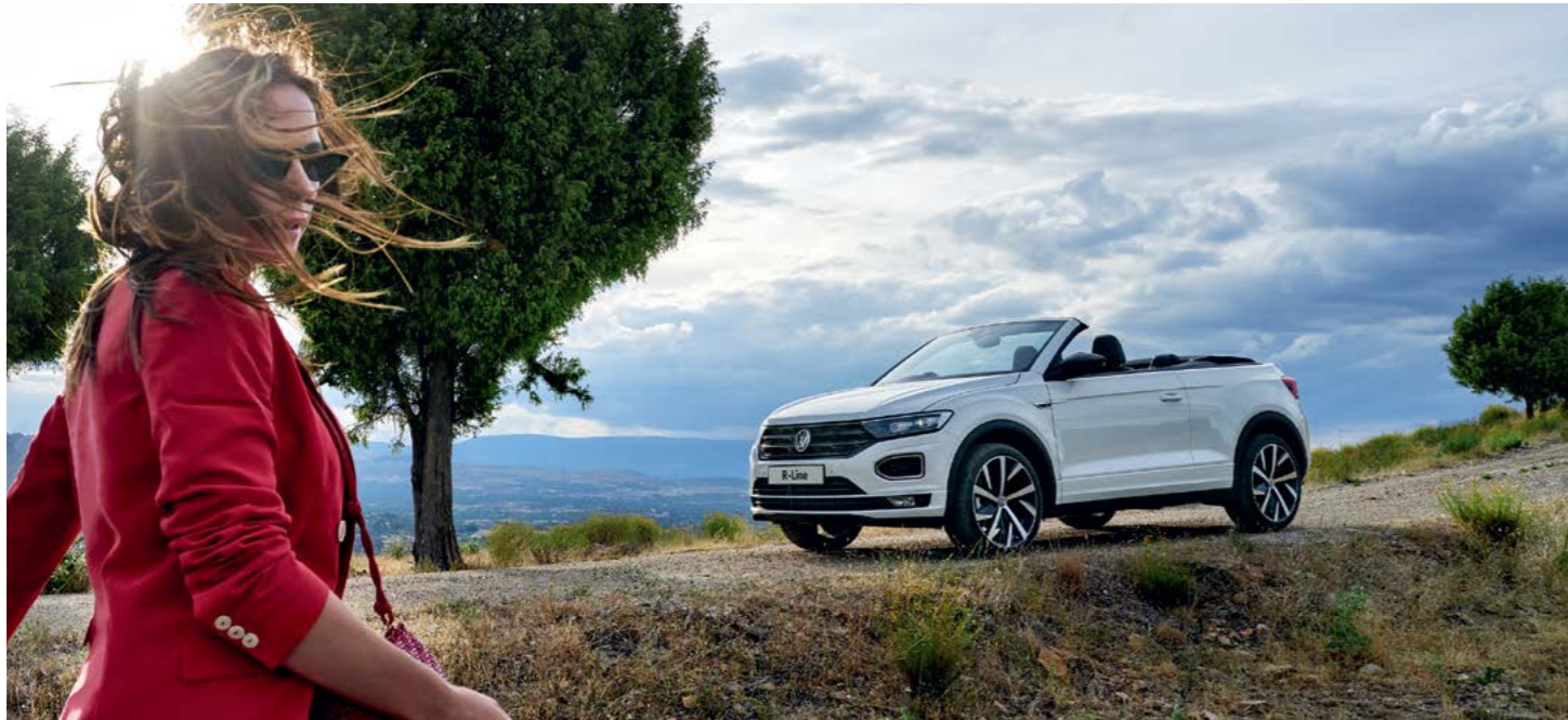
Model shown (above) is T-Roc Cabriolet R-Line with optional 19" 'San Marino' alloy wheels and non-metallic paint. Model shown (right) is new Arteon Shooting Brake R-Line with optional 20" 'Nashville' alloy wheels, Dynamic Chassis Control (DCC), 'IQ. Light' LED headlights, Park Assist and metallic paint.