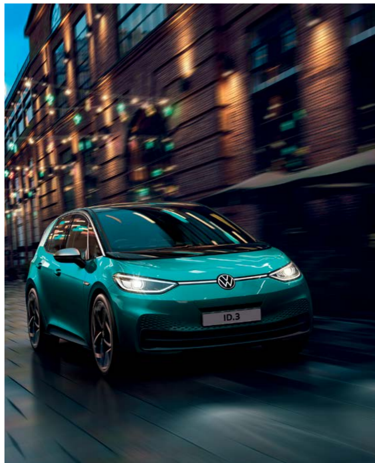
Model shown is ID.3 1 st Edition

Please also take a couple of minutes to check the details we hold for you on your schedule and tell us immediately if there are any mistakes.