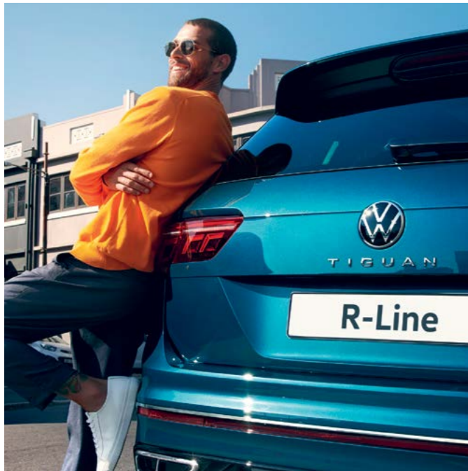
Model shown is new Tiguan R-Line with optional 'IQ. Light' LED headlights and metallic paint.

Whenever the following words or expressions appear in your policy, they have the meaning given below. For ease of reference, defined words or expressions in your policy are shown in bold type.