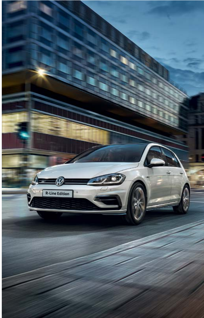
Model shown is Golf R-Line Edition with optional 18" 'Sebring' alloy wheels, panoramic sunroof and Oryx White premium signature paint.