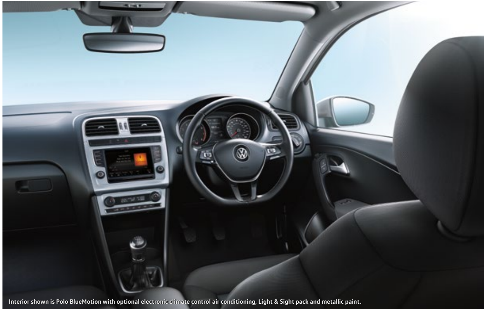
Interior shown is Polo BlueMotion with optional electronic climate control air conditioning, Light & Sight pack and metallic paint.

This shows the information that you gave us , including information given on your behalf and verbal information you gave prior to commencement of the policy.