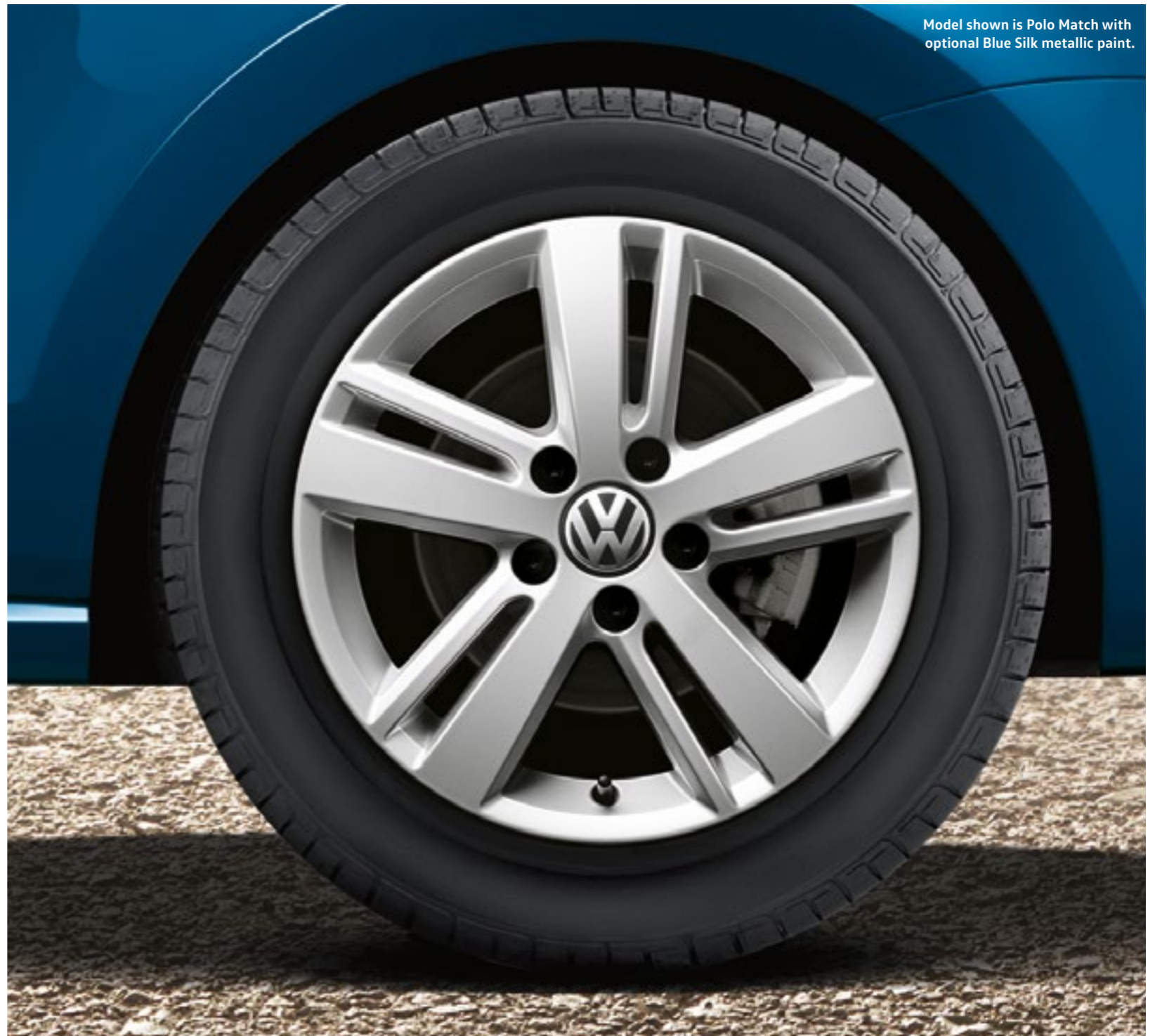
Model shown is Polo Match with optional Blue Silk metallic paint.

The protection provided under this section does not apply to policies provided as part of 'One Year's Insurance Included' campaigns where no premium has been paid to us .