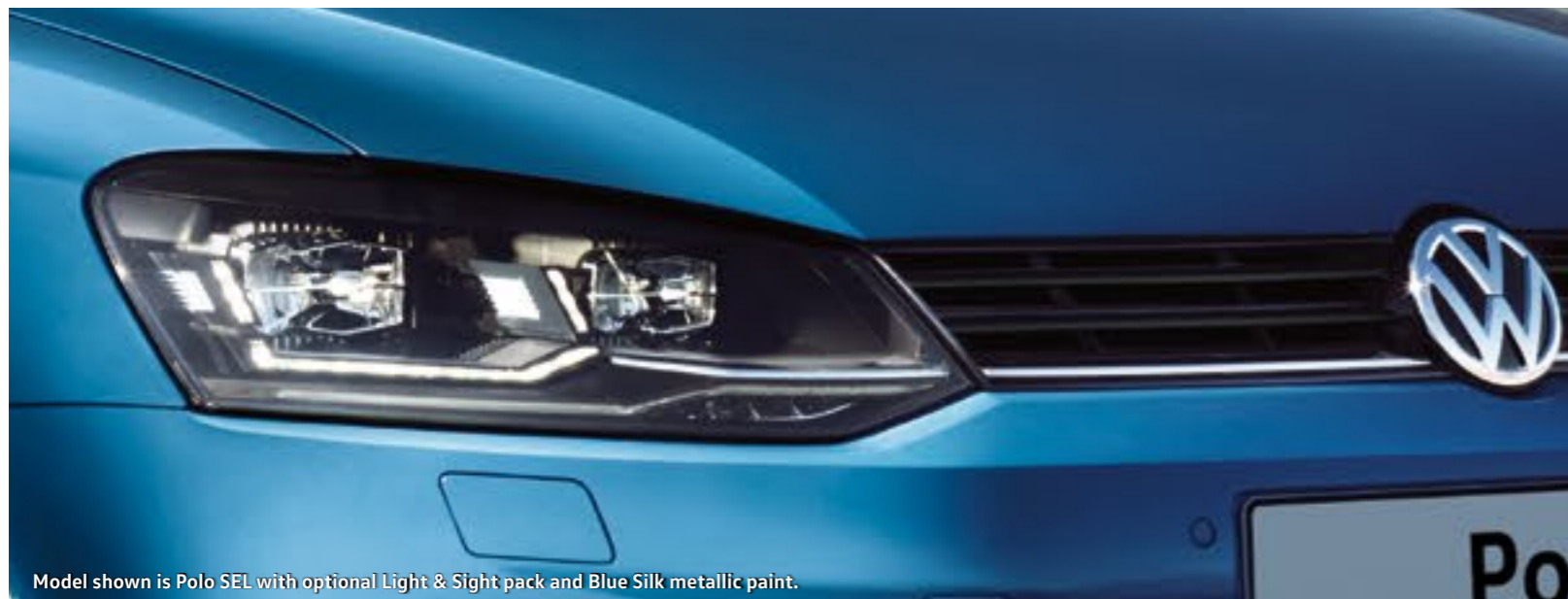
Model shown is Polo SEL with optional Light & Sight pack and Blue Silk metallic paint.