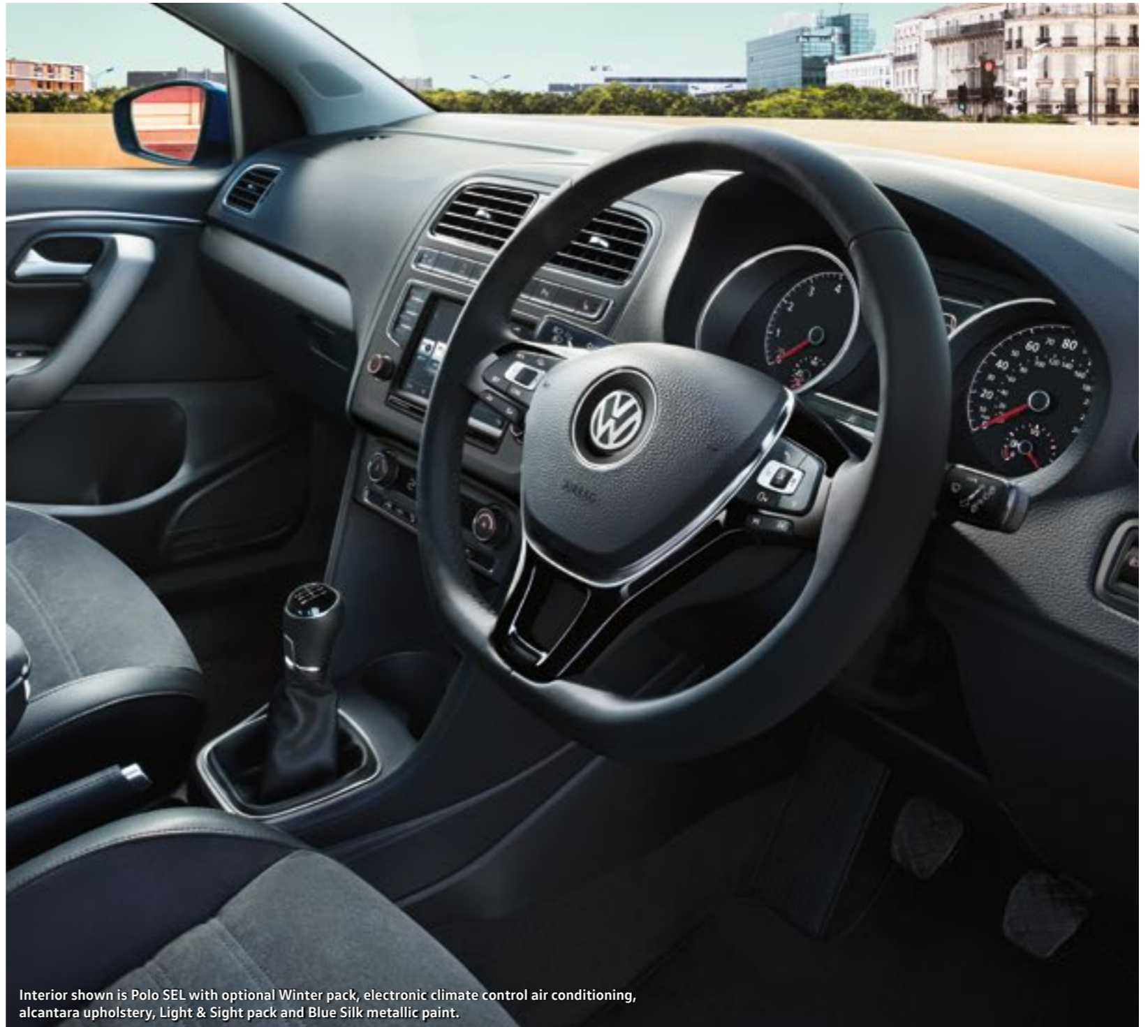
Interior shown is Polo SEL with optional Winter pack, electronic climate control air conditioning, alcantara upholstery, Light & Sight pack and Blue Silk metallic paint.