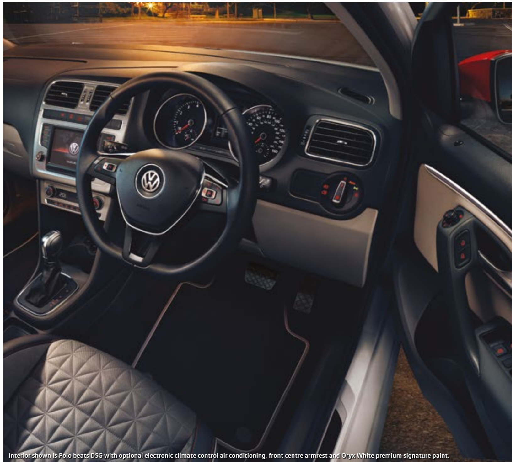
Interior shown is Polo beats DSG with optional electronic climate control air conditioning, front centre armrest and Oryx White premium signature paint.