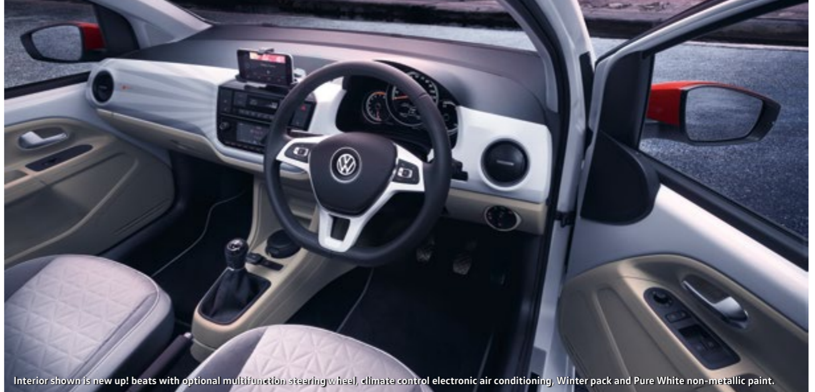
Interior shown is new up! beats with optional multifunction steering wheel, climate control electronic air conditioning, Winter pack and Pure White non-metallic paint.