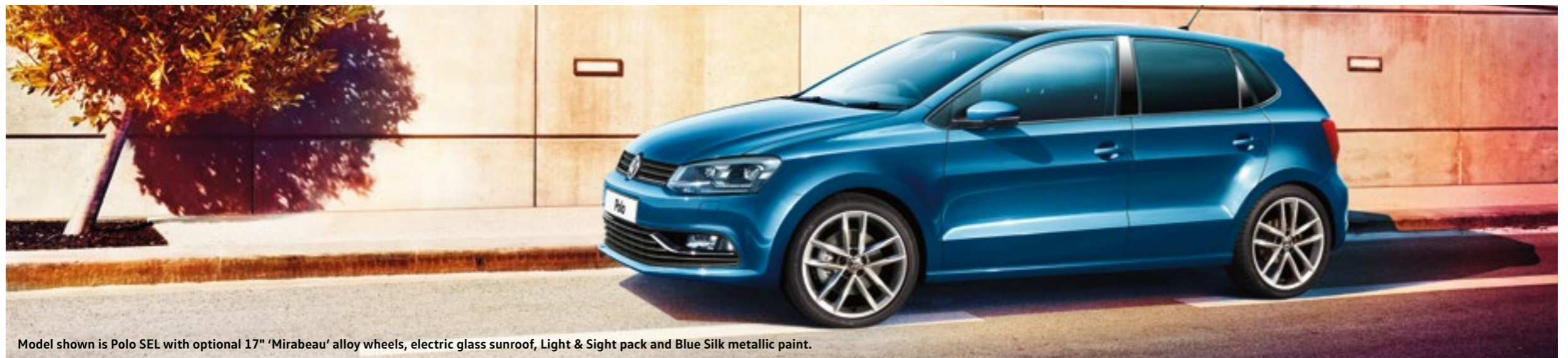
Model shown is Polo SEL with optional 17" 'Mirabeau' alloy wheels, electric glass sunroof, Light & Sight pack and Blue Silk metallic paint.

However, we will provide the minimum cover needed under compulsory motor legislation.