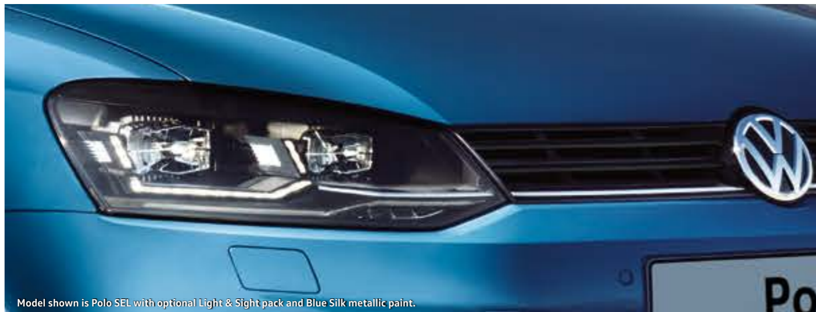
Model shown is Polo SEL with optional Light & Sight pack and Blue Silk metallic paint.