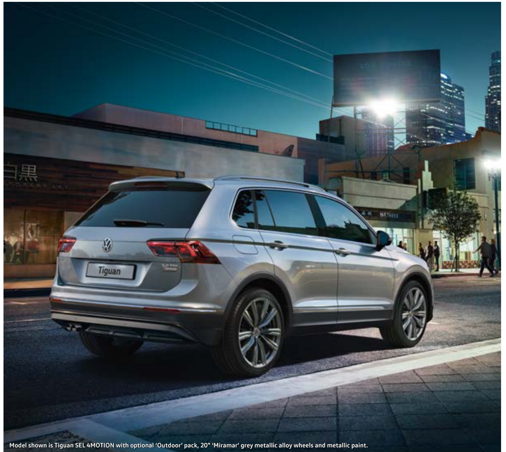
Model shown is Tiguan SEL 4MOTION with optional 'Outdoor' pack, 20" 'Miramar' grey metallic alloy wheels and metallic paint.

You may have to pay your excess when you first claim and you may also temporarily lose your No Claims Discount. If subsequently we are satisfied that the accident was not your fault we will repay your excess , reinstate your No Claims Discount and refund any premium which may be due to you .