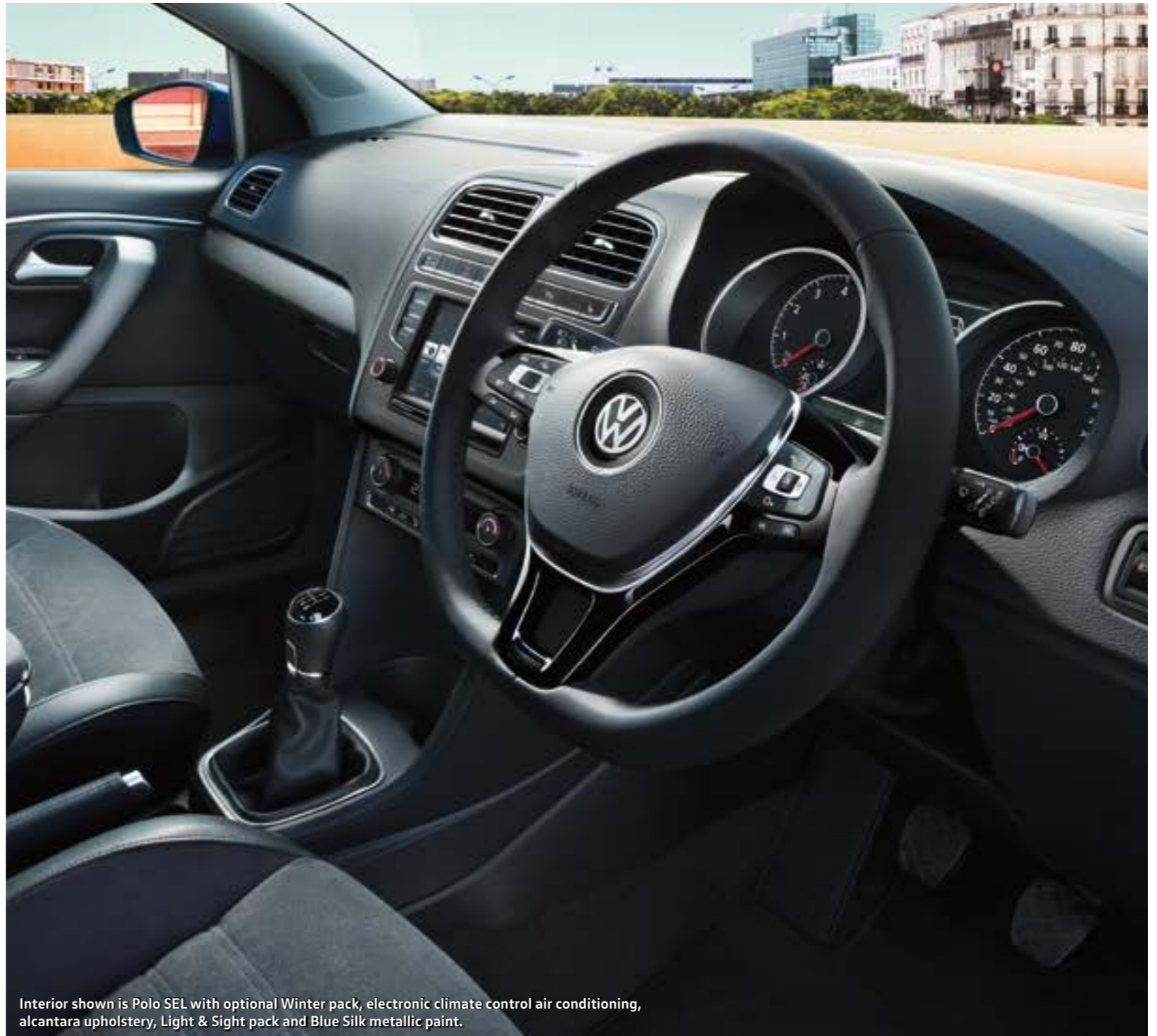
Interior shown is Polo SEL with optional Winter pack, electronic climate control air conditioning, alcantara upholstery, Light & Sight pack and Blue Silk metallic paint.