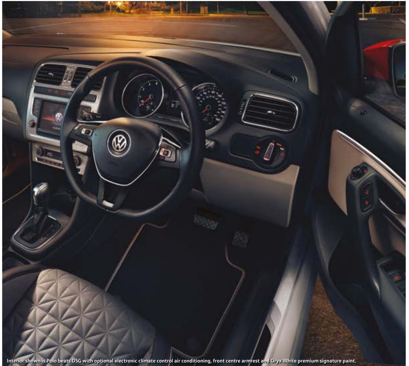
Interior shown is Polo beats DSG with optional electronic climate control air conditioning, front centre armrest and Oryx White premium signature paint.