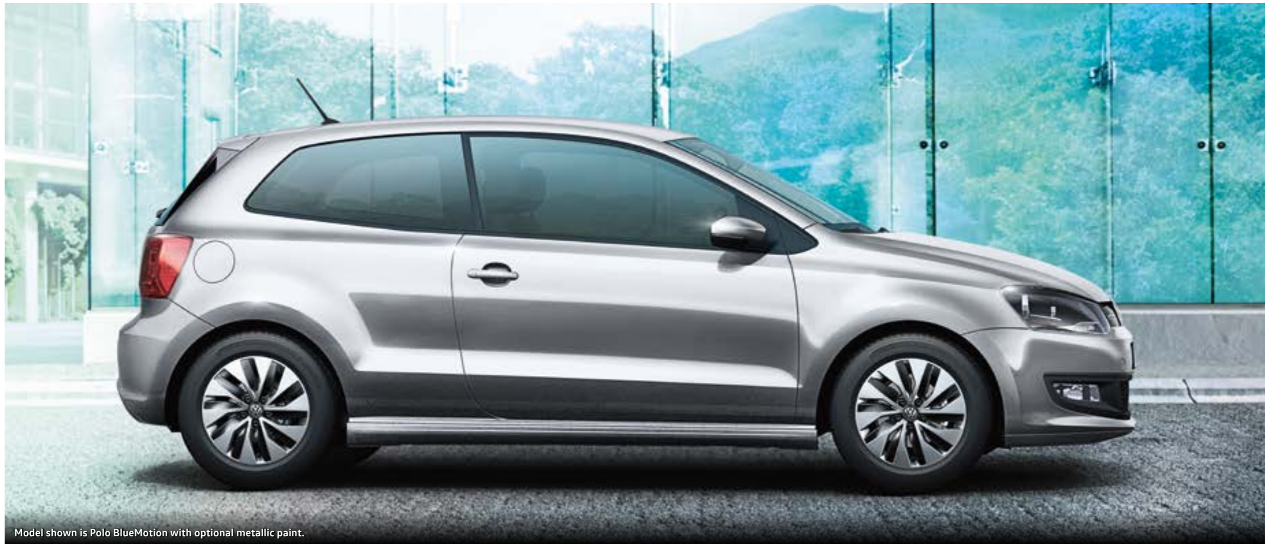
Model shown is Polo BlueMotion with optional metallic paint.