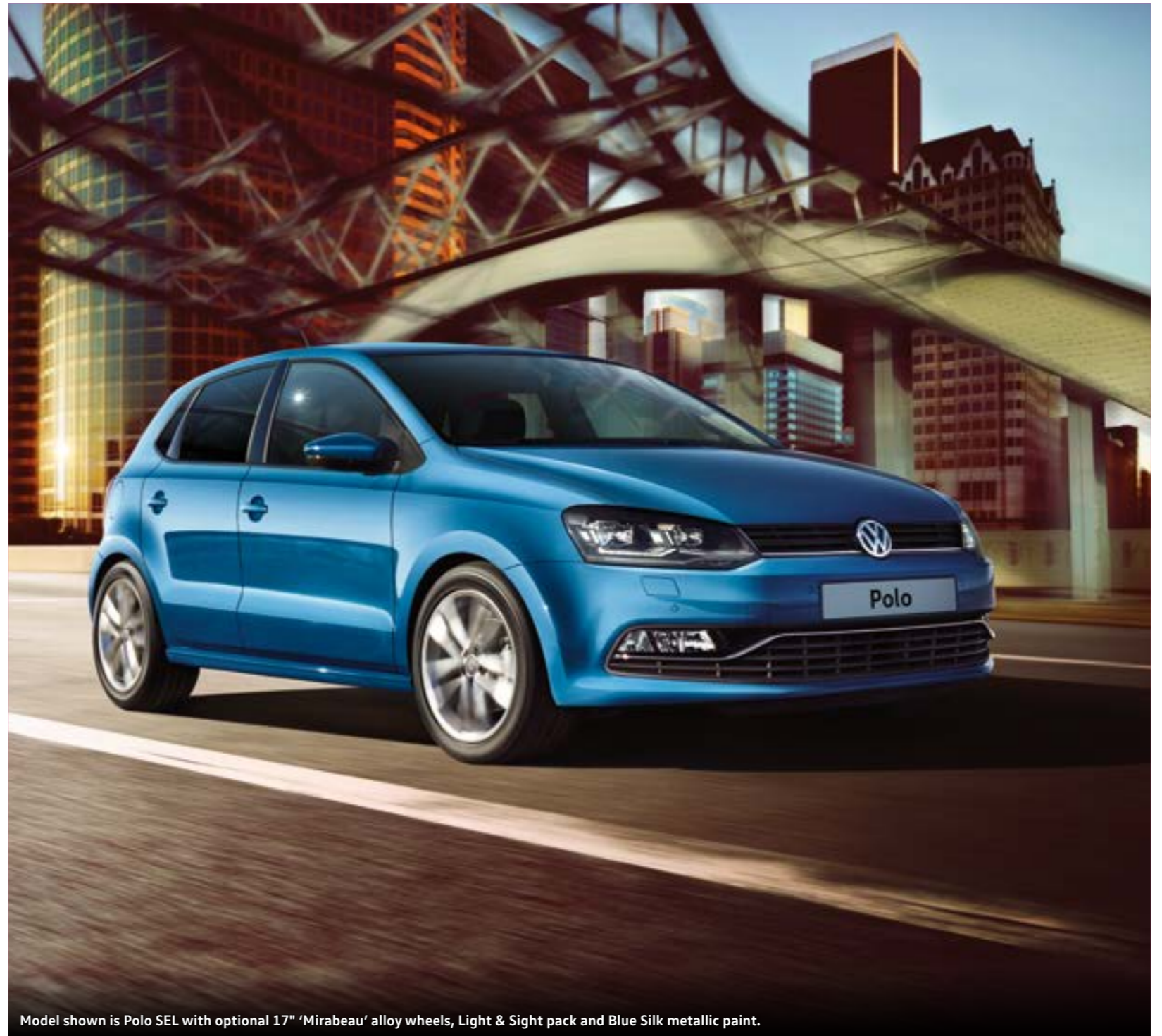
Model shown is Polo SEL with optional 17" 'Mirabeau' alloy wheels, Light & Sight pack and Blue Silk metallic paint.

If you have four or more years of No Claims Discount you may choose to take out extra cover to protect it as defined in Section K – No Claims Discount protection.