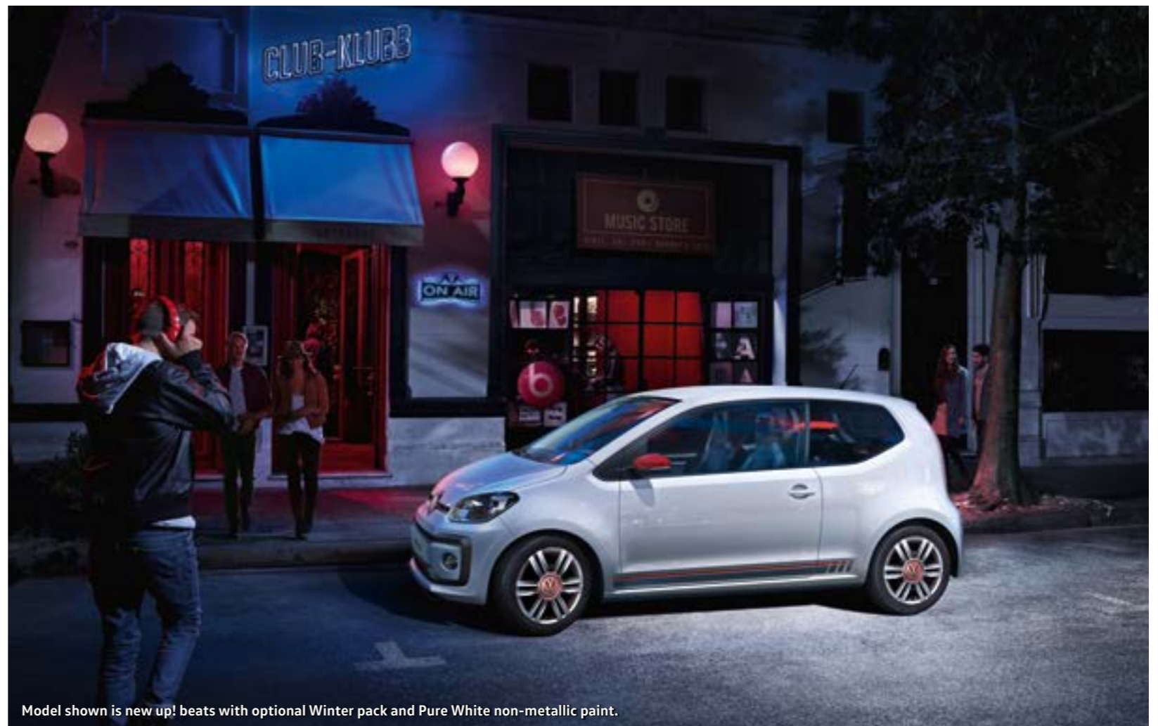
Model shown is new up! beats with optional Winter pack and Pure White non-metallic paint.

The exceptions applying to sections A, C & G of this insurance also apply to this section.