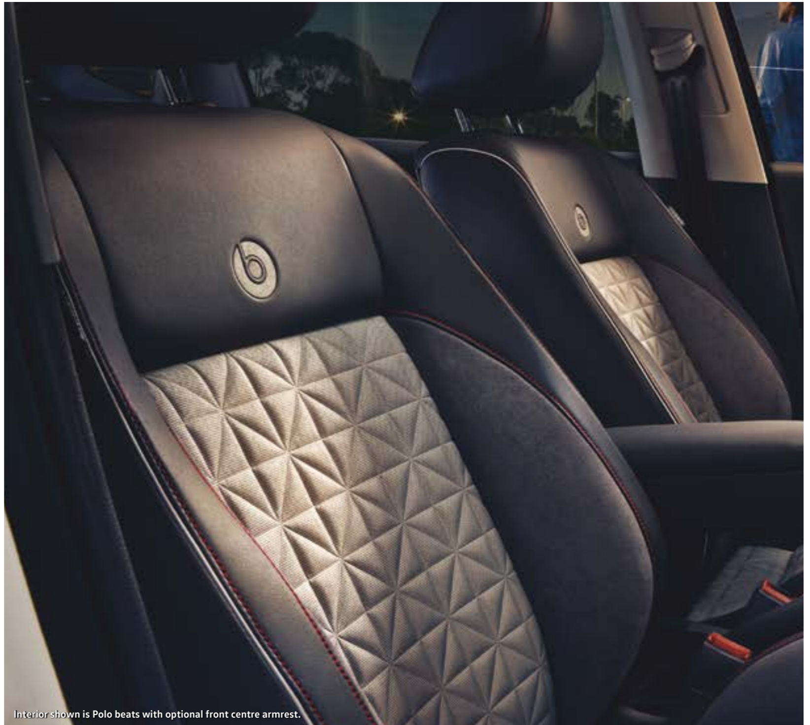
Interior shown is Polo beats with optional front centre armrest.