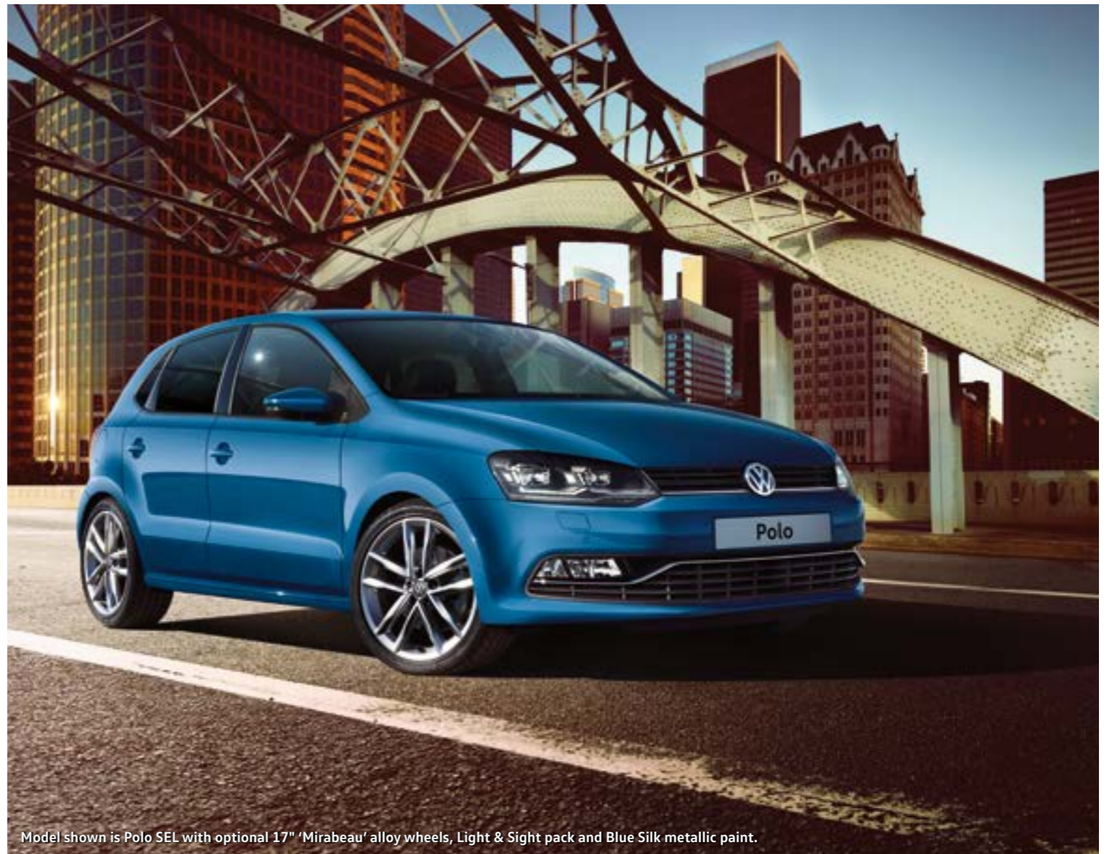
Model shown is Polo SEL with optional 17" 'Mirabeau' alloy wheels, Light & Sight pack and Blue Silk metallic paint.

Front cover model shown is Polo GTI with optional electric glass sunroof and Oryx White premium signature paint.