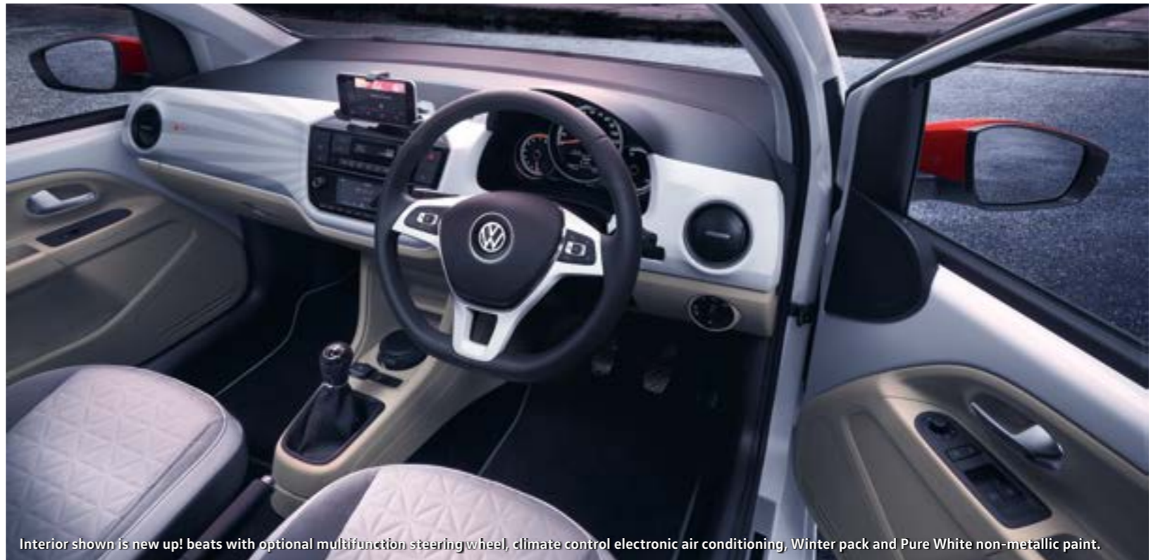
Interior shown is new up! beats with optional multifunction steering wheel, climate control electronic air conditioning, Winter pack and Pure White non-metallic paint.