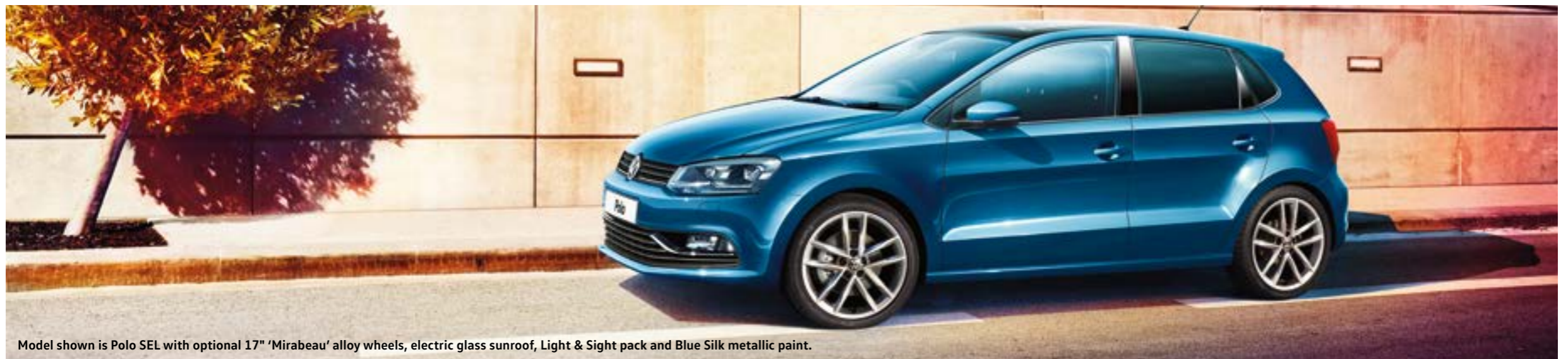
Model shown is Polo SEL with optional 17" 'Mirabeau' alloy wheels, electric glass sunroof, Light & Sight pack and Blue Silk metallic paint.

However, we will provide the minimum cover needed under compulsory motor legislation.