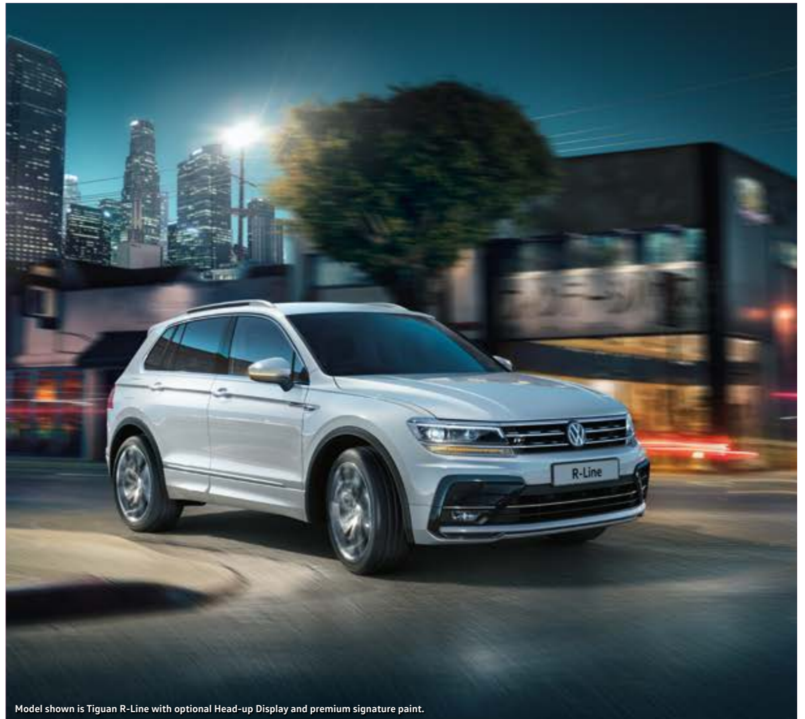
Model shown is Tiguan R-Line with optional Head-up Display and premium signature paint.