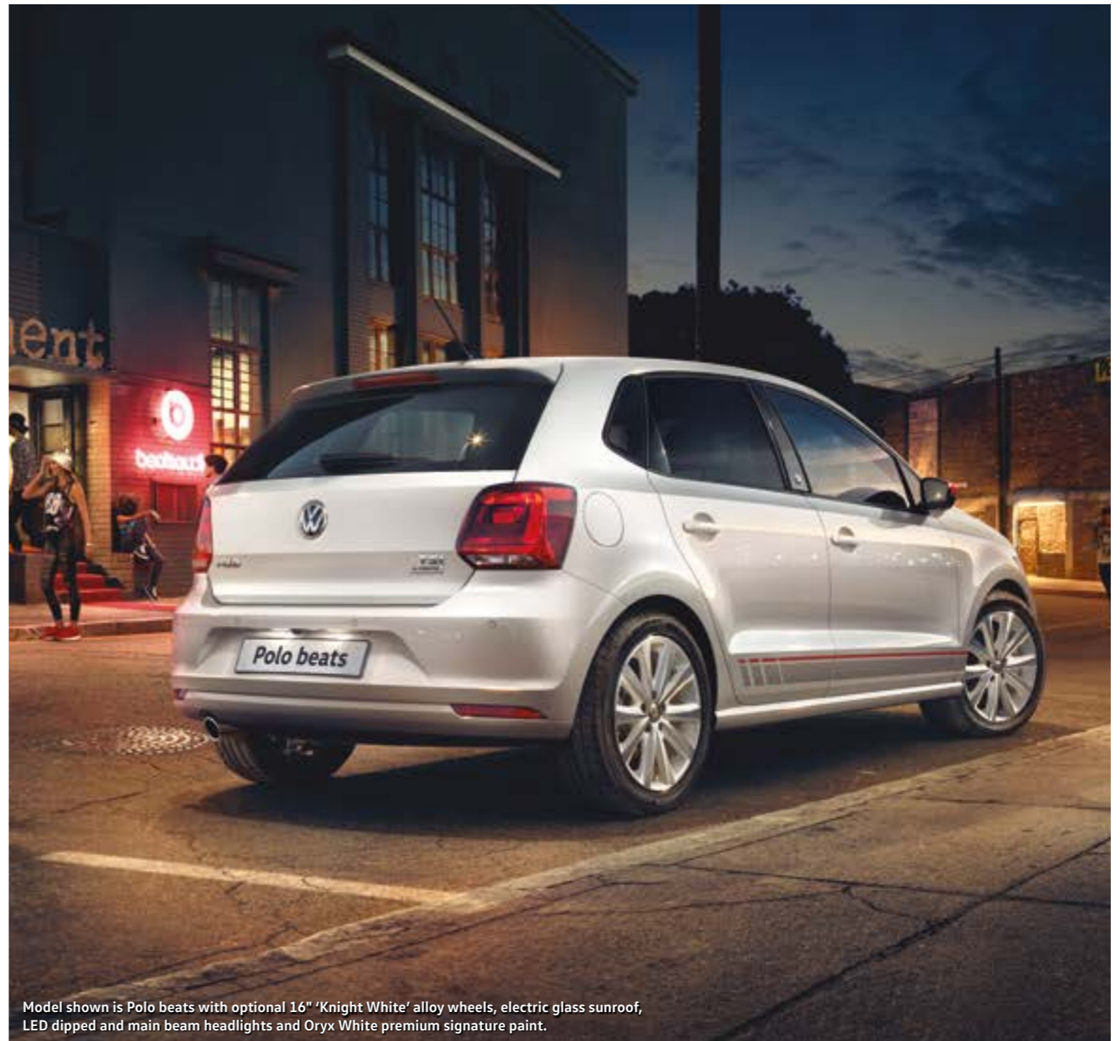
Model shown is Polo beats with optional 16" 'Knight White' alloy wheels, electric glass sunroof, LED dipped and main beam headlights and Oryx White premium signature paint.

This policy is a contract between you and us. It is not our intention that the Contracts (Rights of Third Parties) Act 1999 gives anyone else either any rights under this policy or the right to enforce any part of it.