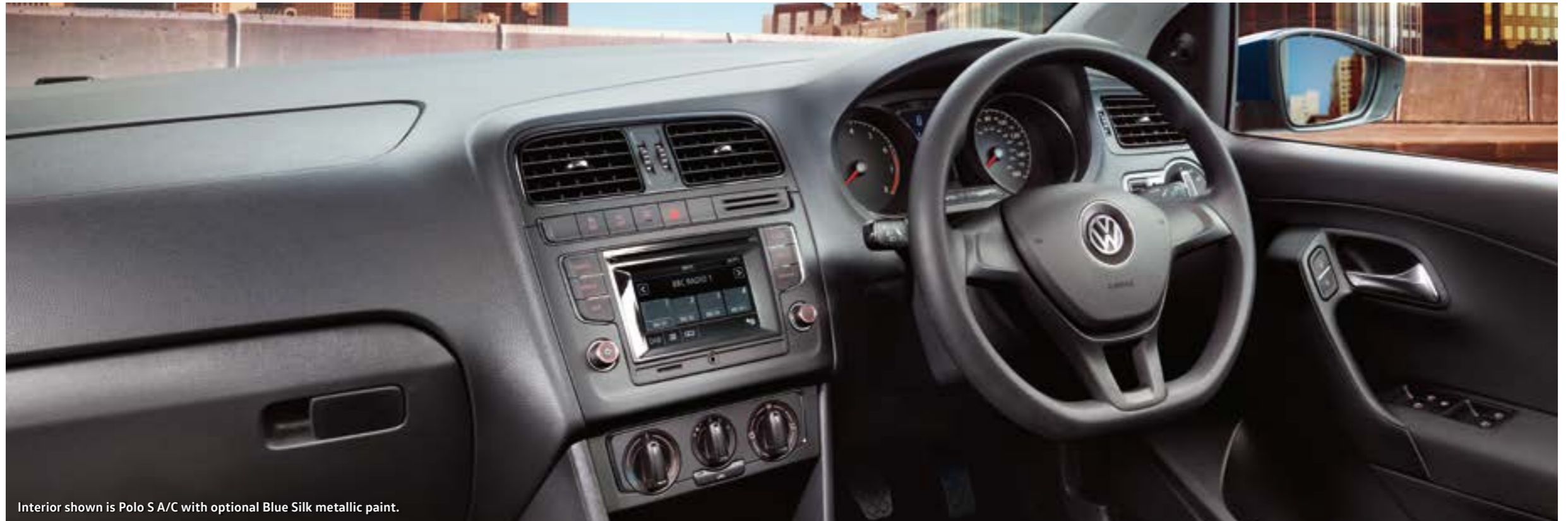
Interior shown is Polo S A/C with optional Blue Silk metallic paint.

If you , or a member of your family have more than one motor insurance policy with us , we will only pay under one policy.